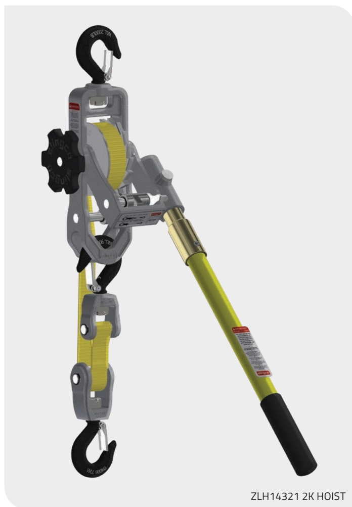
ZLH14321 2K HOIST