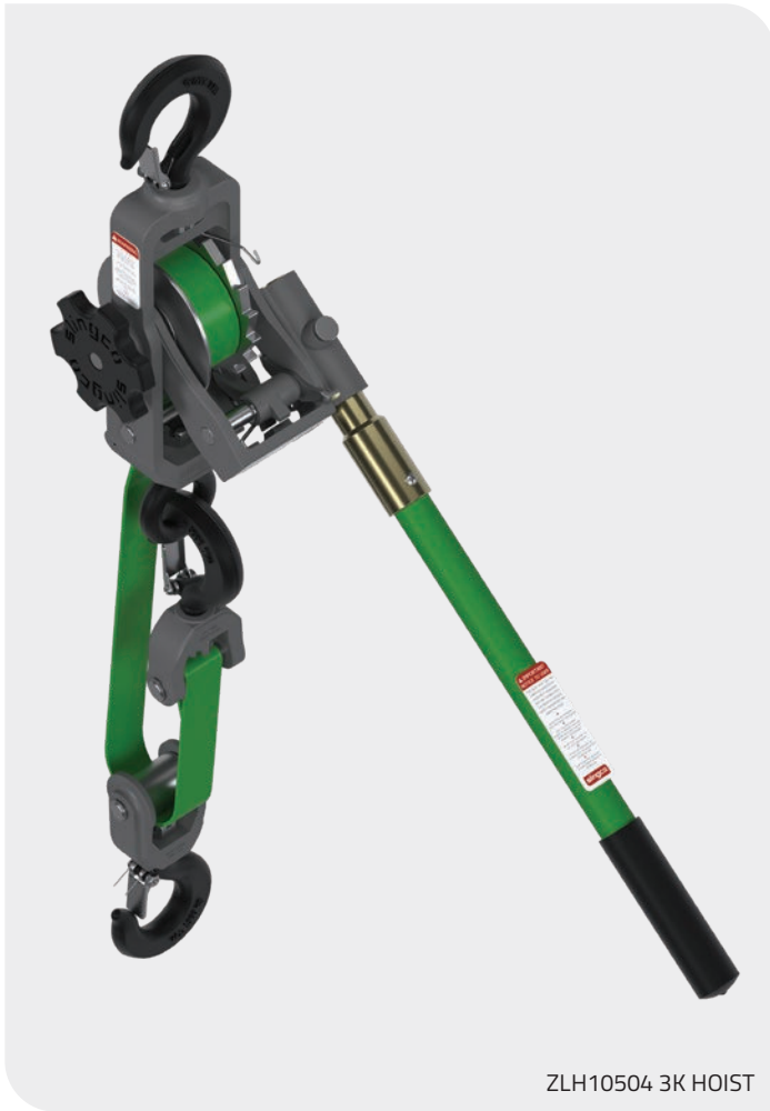
ZLH10504 3K HOIST