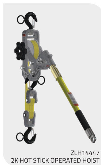
ZLH14447 2K HOT STICK OPERATED HOIST