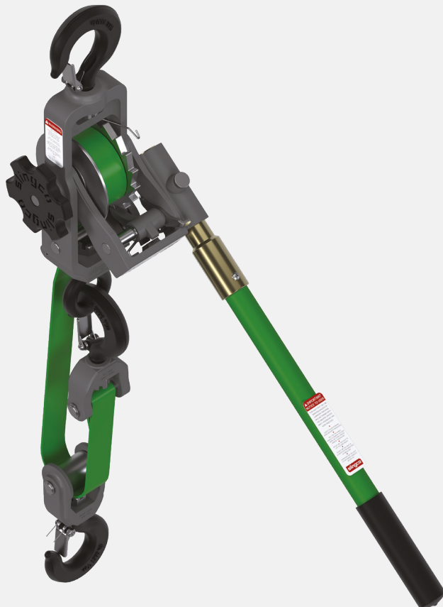
ZLH10504 3K HOIST