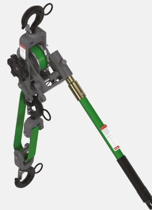
ZLH10524 3K HOT STICK OPERATED HOIST