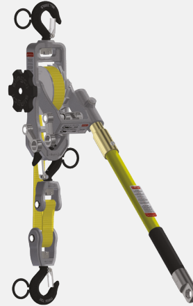
ZLH14447 2K HOT STICK OPERATED HOIST