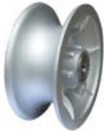
Ductile Iron (DI)