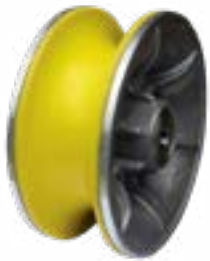
Urethane Lined (LS)