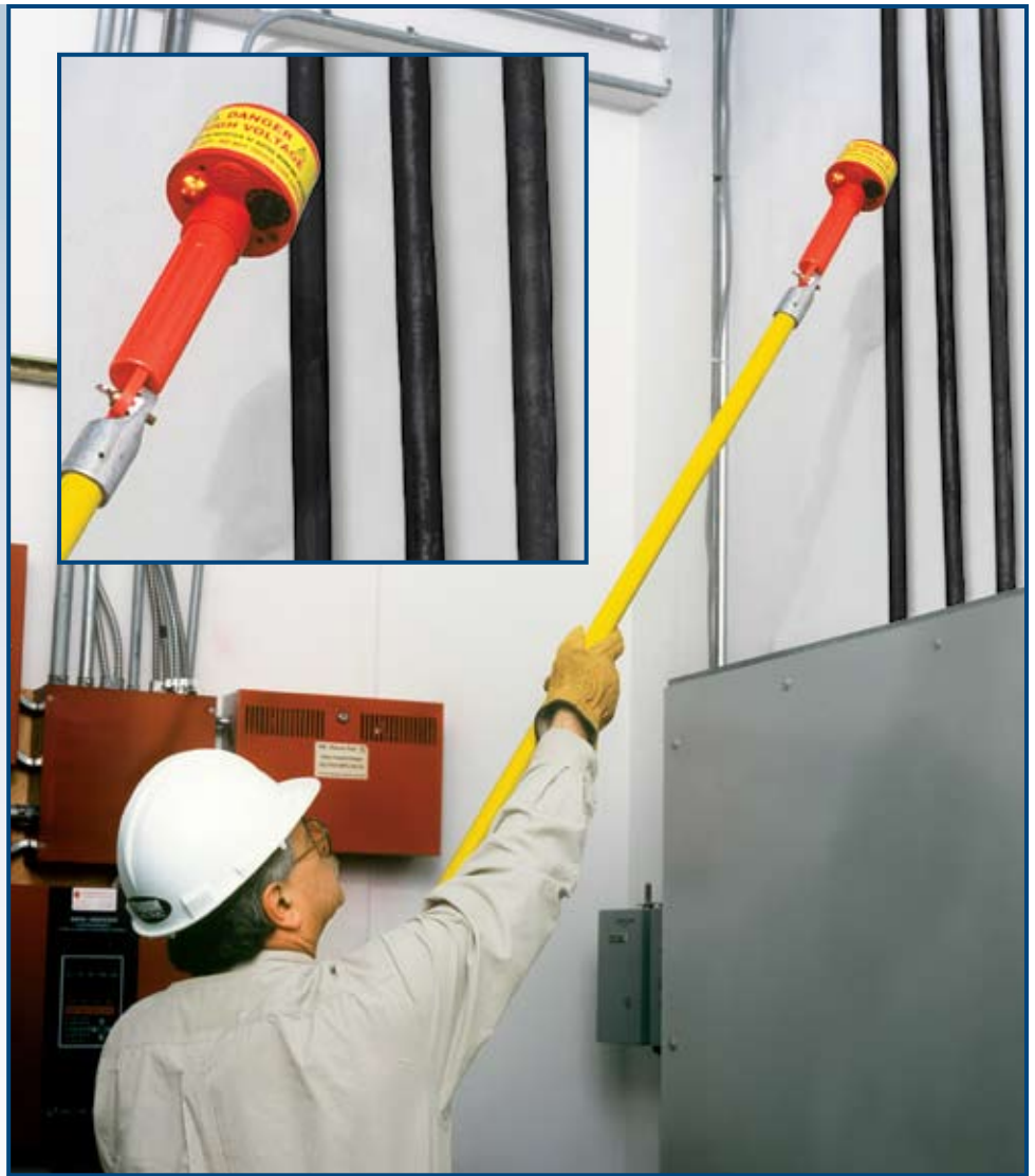
Model 275HVD checking for live voltage on main feeder

The Model 275HVD is powered by three standard Alkaline C cell batteries and can be used both in- and out-of-doors. A universal spline on the back-end facilitates attachment to any standard hot stick. A self-test position ensures that all circuitry and indicators are working properly before use.